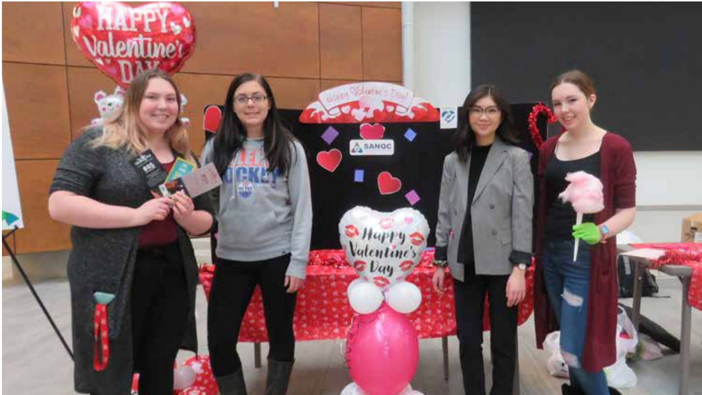
Student Practical Nurse Society - Valentine's Day Event

Your club might receive donations from someone you know. Donations of monetary value must be deposited to your club using a Club Funds Deposit Form. Donations of tangible value need to be accompanied by a letter from the donor that includes who they are and what they are donating to your group. This letter is required by SANQC for any donations received by a club.