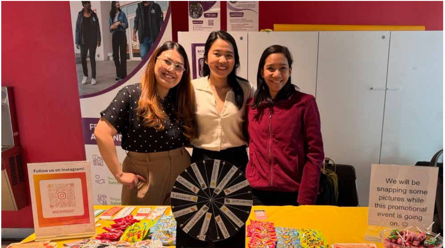
Student Book Club - Promo Booth

Your club might receive donations from someone you know. Donations of monetary value must be deposited to your club using a Club Funds Deposit Form. Donations of tangible value need to be accompanied by a letter from the donor that includes who they are and what they are donating to your group. This letter is required by SANQC for any donations received by a club.